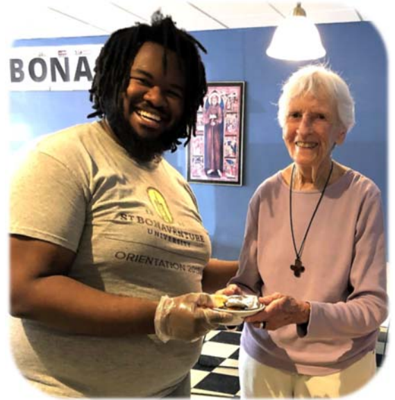
The Warming House - A Ministry of St. Bonaventure University (Olean, New York)

Sunday through Friday, the doors open at 2:30 p.m., and a